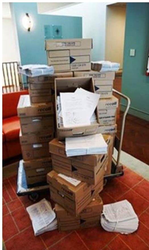
The largest petition presented in the House of Representatives

Following the introduction of e-petitioning in the 45th Parliament, there has been renewed interest in petitioning the House. In 2017, 329 petitions were presented (both paper and e-petitions). 2021 was a peak year for petitioning, with 780 petitions presented and record numbers of signatures. In 2024, 683 petitions were presented. Since recording of signatures began in 1988, the petition with the greatest number of signatures was presented on 26 February 2014 concerning funding support for community pharmacies, with 1,210,471 signatures. The second largest was presented on 4 December 2000 concerning taxation and beer prices, with 792,985 signatures. The largest e-petition was presented on 9 November 2020 concerning media ownership, with 501,876 signatures.